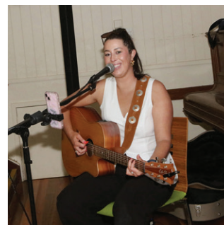
Music by Tuscany Mellor